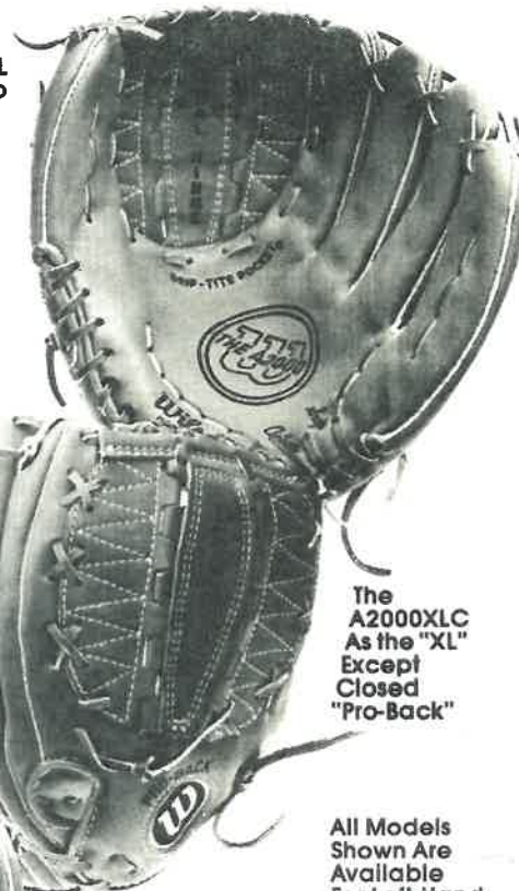
The A2000XLC As the "XL" Except Closed "Pro-Back"

All Models Shown Are Available For Left-Hand Players Also