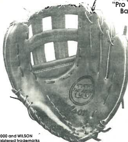
A2000XXL With open web design and "Pro Back"